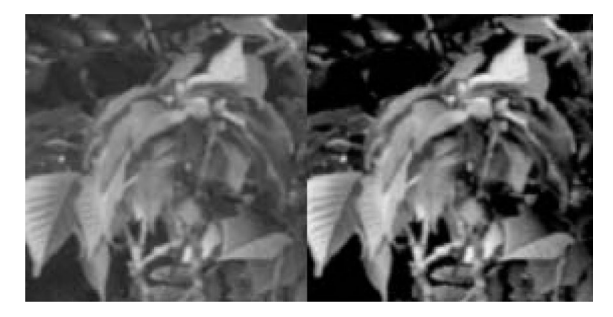
Figure 2. inlab 5. A color reproduction of the original image (left) and modified image ( k_{max} = 80 ) (right)

The second set of tests was produced through variation of the vividness parameter, closely related to highlight reproduction in an image. As the highlight was modified through kurtosis change, the test images were produced with the help of Eq.3 (with k_{max} equal to 5, 10, 30, 60). Fig. 2 shows the effect of the vividness change in color reproduction of a spectral image.